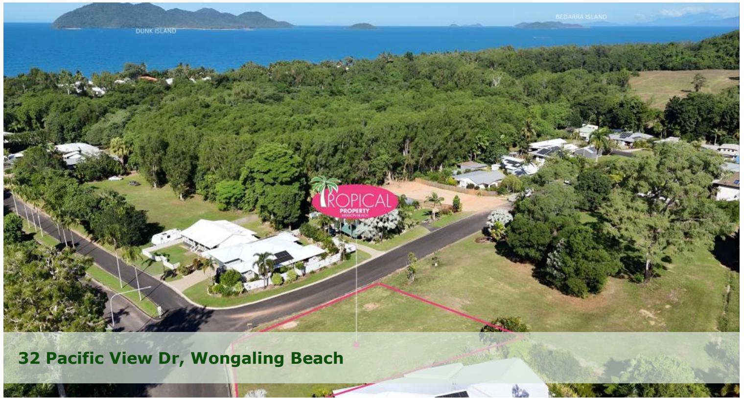
32 Pacific View Dr, Wongaling Beach