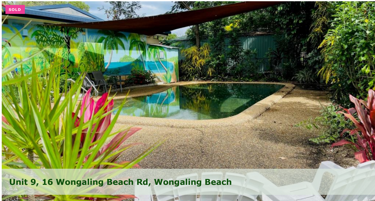
Unit 9, 16 Wongaling Beach Rd, Wongaling Beach