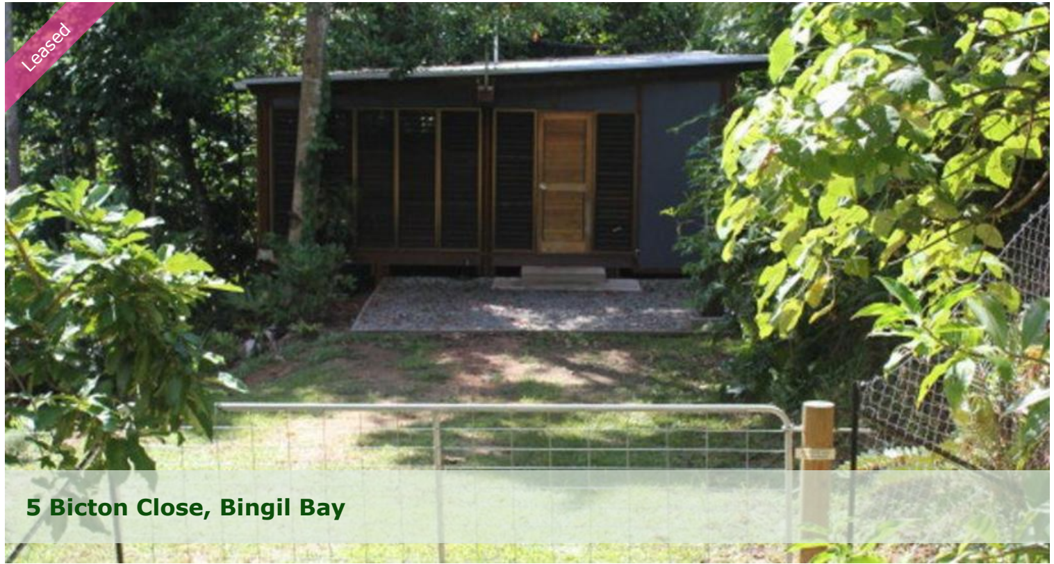
5 Bicton Close, Bingil Bay