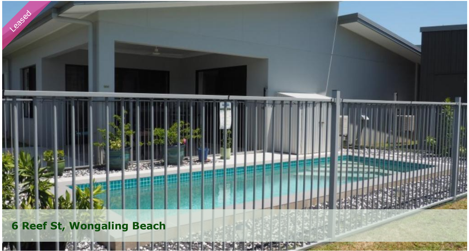
6 Reef St, Wongaling Beach