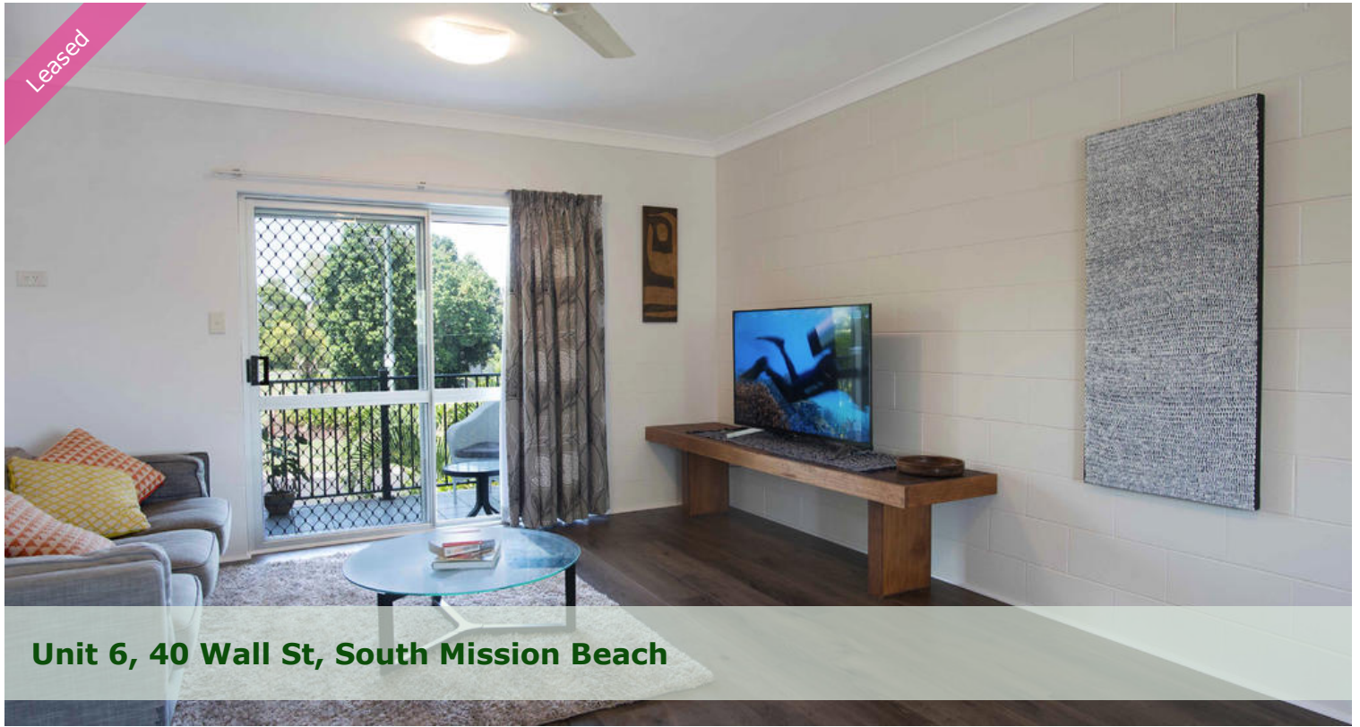
Unit 6, 40 Wall St, South Mission Beach